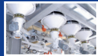
» DOSING & WEIGHING