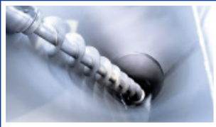
» MIXING & DRYING