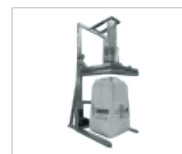
Filling bigbags, drums