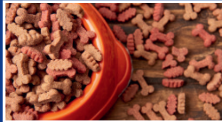
» ANIMAL FEED