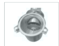
Dosing & weighing