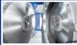
» PARTICLE PROCESSING