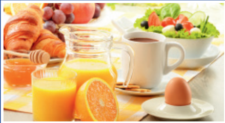
» FOOD & BEVERAGE