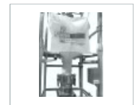
Emptying bigbags, sacks, containers