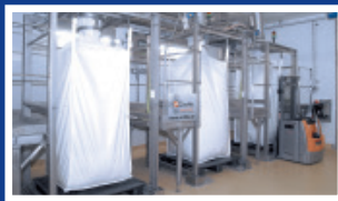
» BIGBAG & SACK UNLOADING