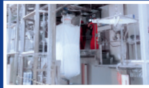
» BIGBAG & TRUCK LOADING