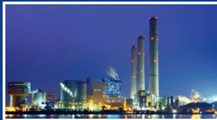
» ENVIRONMENT & POWER PLANTS