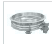
Emptying silos, hoppers