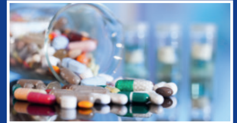
» PHARMA & COSMETICS