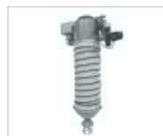
Filling trucks, waggons